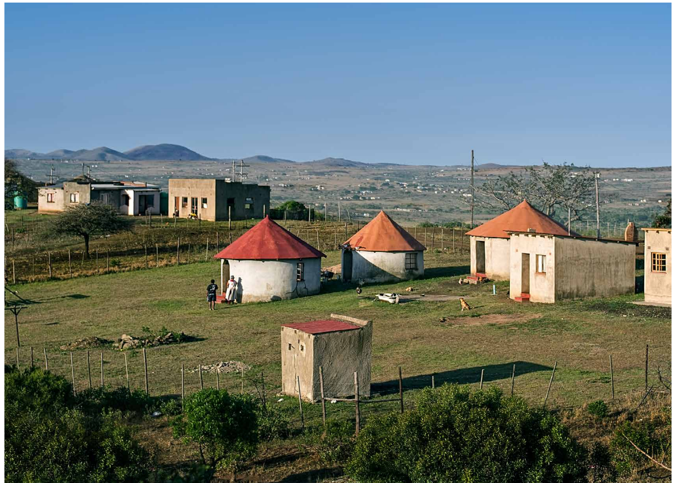
Community healthcare workers should be provided with the necessary support to care for their communities.

“This includes training on chronic conditions such as high blood pressure, diabetes, TB and HIV. They also require further training on CPR, wound dressing and first aid management of snake bites,”